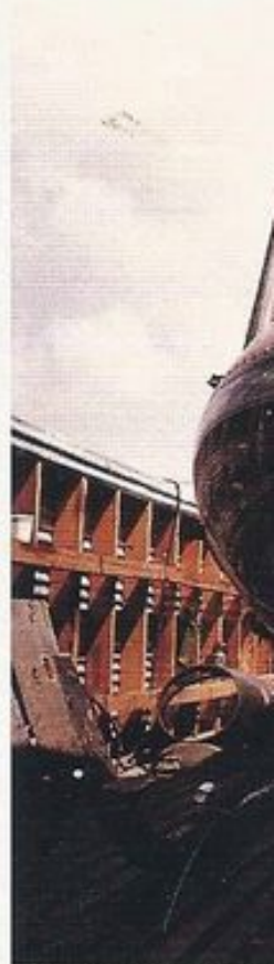
This UH-1 carried aircraft was assigned to the 117th Assault Helicopter Company in 1969.