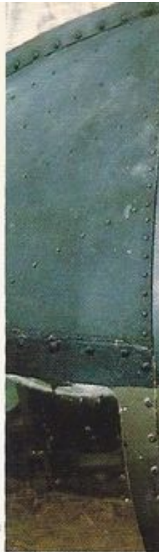
PISTOL PETE was one of the KILLER HAWK UH-1s of the 187th Assault Helicopter Company, the Crusaders.